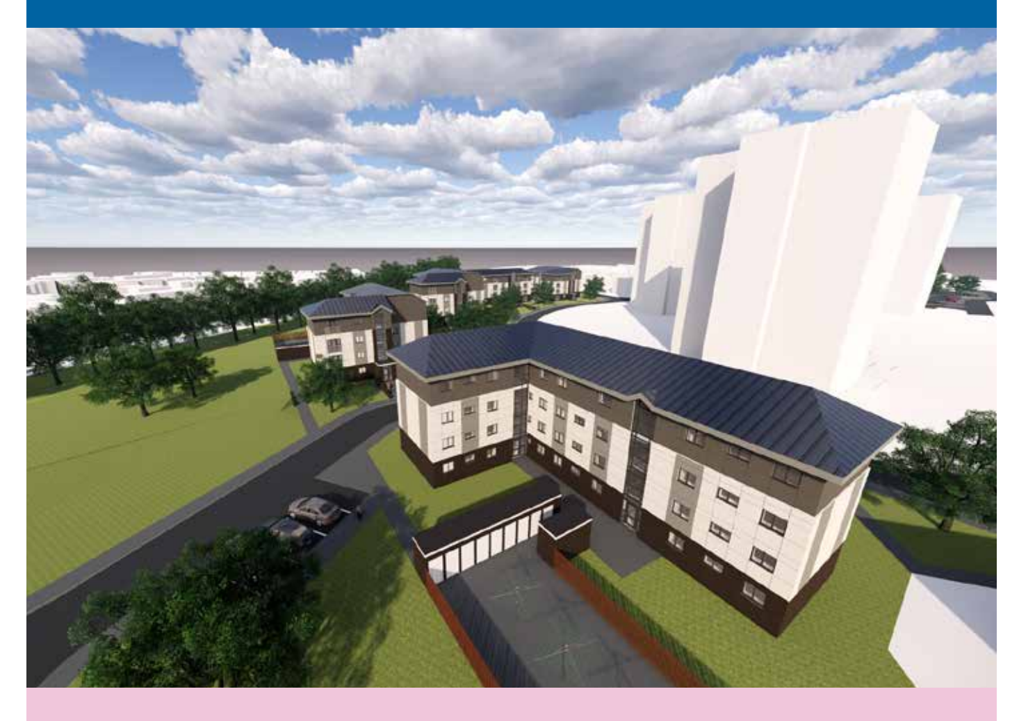
Our Design Team will soon start external works to five low-rise blocks in Oldbury.

Known collectively as 'The Lakes', the five housing blocks – Rydal, Ullswater, Derwent, Coniston and Windermere will have new windows, doors and cladding to improve their energy efficiency and aesthetics – plus a new third floor comprising of four new flats to each block.