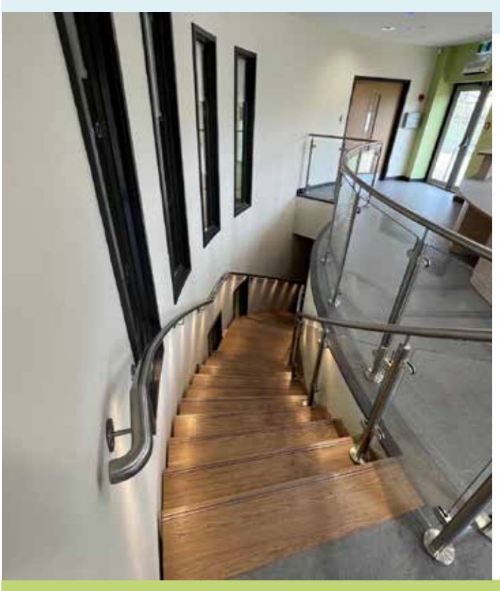
Urban Design and Building Services

For further information please contact: udbs_customercontact@sandwell.gov.uk