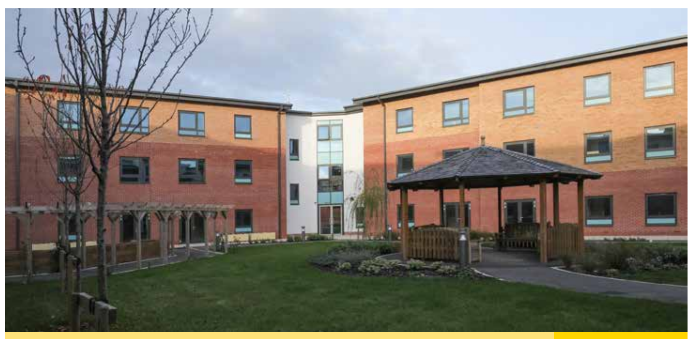
Urban Design and Building Services

For further information please contact: UDBS_customercontact@sandwell.gov.uk